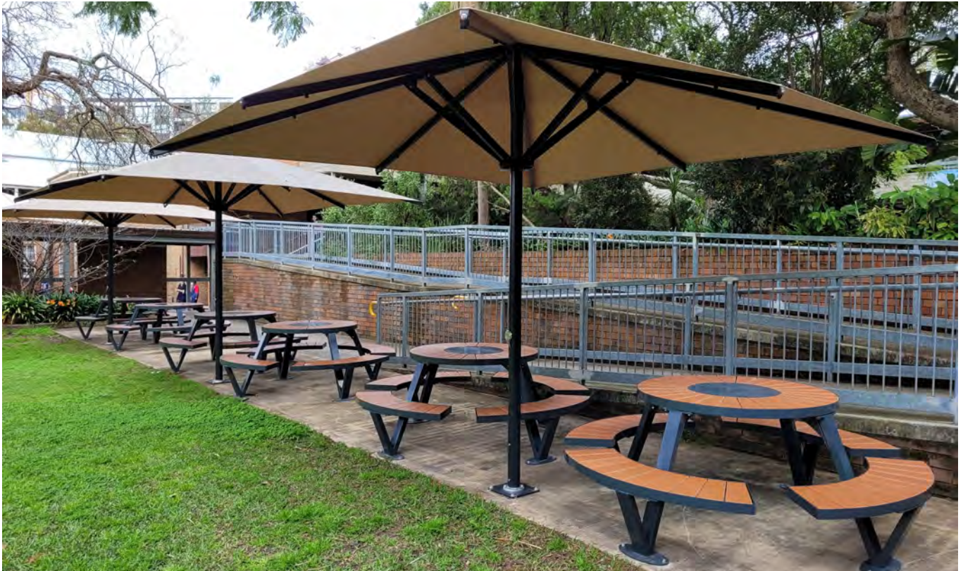
ARCHER SETTINGS WITH UMBRELLA