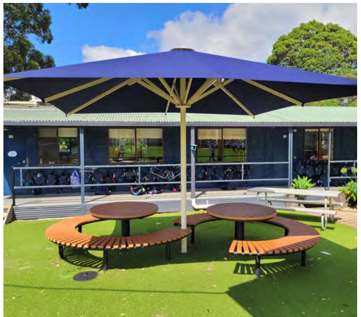
CONROD DOUBLE SETTING WITH UMBRELLA