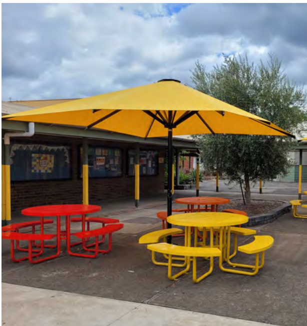
MONTEREY SETTINGS WITH UMBRELLA