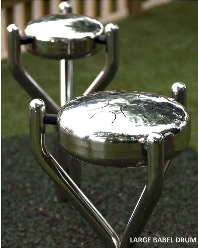
LARGE BABEL DRUM

Address: 7D/1-3 Endeavour Rd, Caringbah NSW 2229